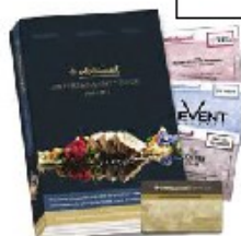
The Entertainment ™ Book

Wellington Deaf Society To order your Entertainment ™ Membership Visit: www.entbook.co.nz/1087r45