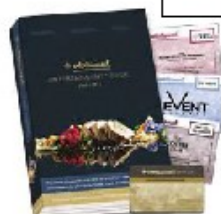
The Entertainment ™ Book

Wellington Deaf Society To order your Entertainment ™ Membership Visit: www.entbook.co.nz/1087r45