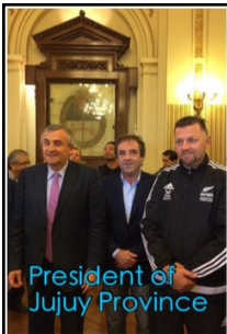
President of Jujuy Province