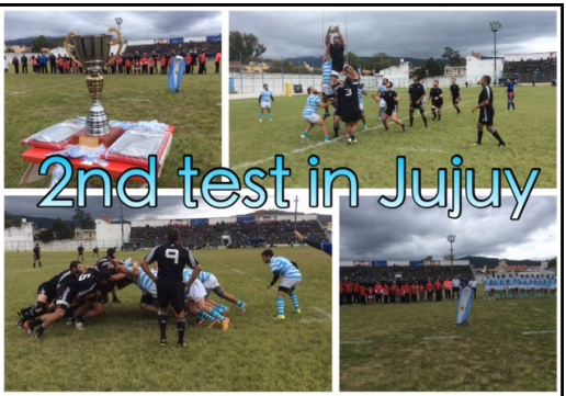
2nd test in Jujuy