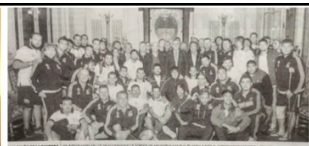
"Pumas" y "All Blacks"

El Gobernador recibió a los representantes de la selección argentina de rugby y los jugadores de la selección de rugby de la Argentina.