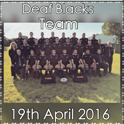
Deaf Blacks Team