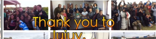
Thank you to Jujuy.