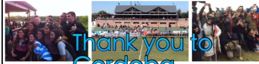
Thank you to Cordoba.