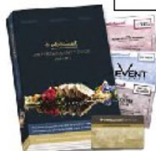
The Entertainment ™ Book

Wellington Deaf Society To order your Entertainment ™ Membership Visit: www.entbook.co.nz/1087r45